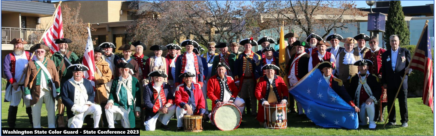
Washington State Color Guard - State Conference 2023