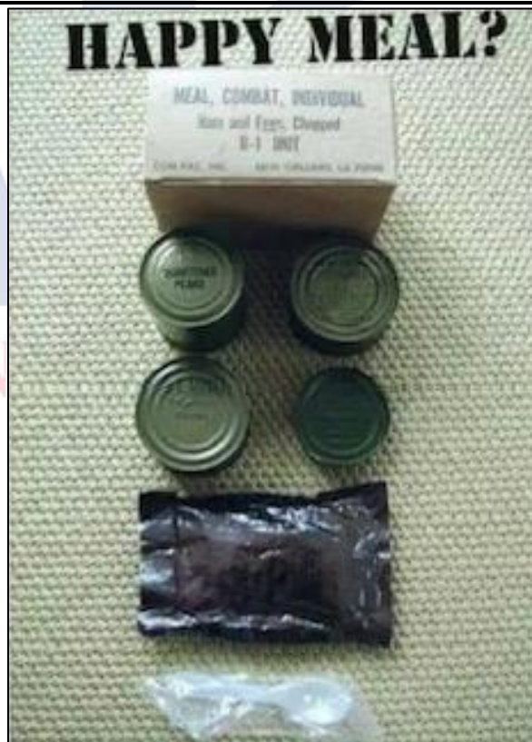
Anyone remember these???