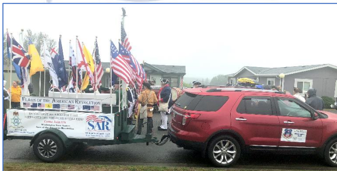
The Flag Trailer was also present.