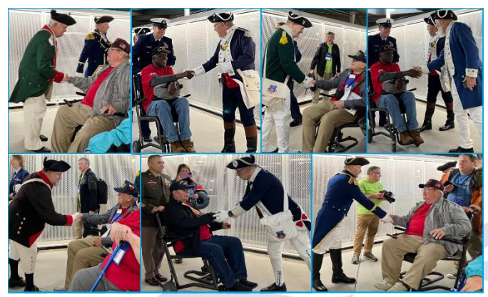
Meet & Greet

16 Oct, Honor Flight: The flight was greeted by 7 members of the WA St CG.