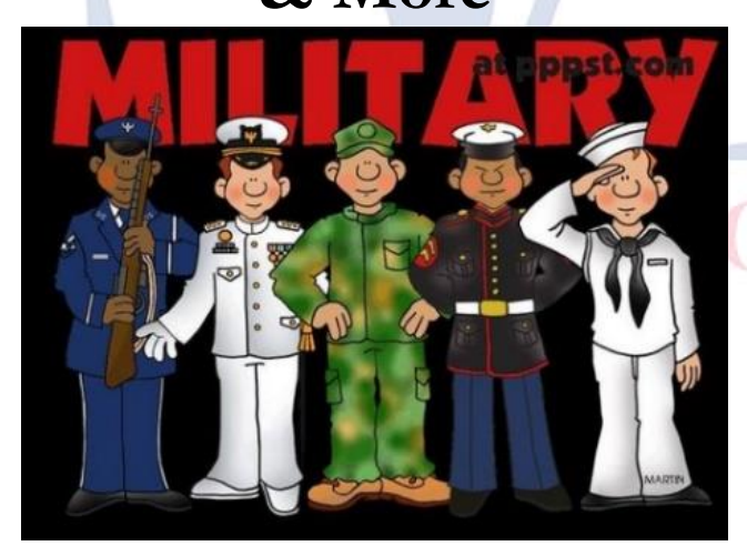
Military Humor highlights is from the <u>Facebook group</u> by the same name