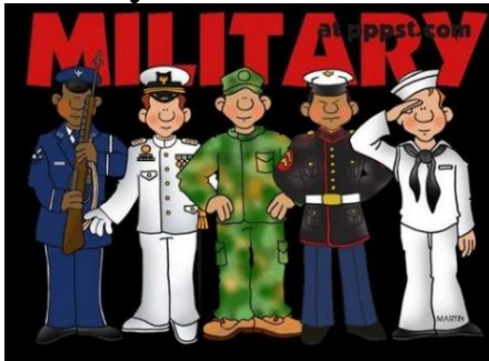
Military Humor highlights is from the Facebook group by the same name