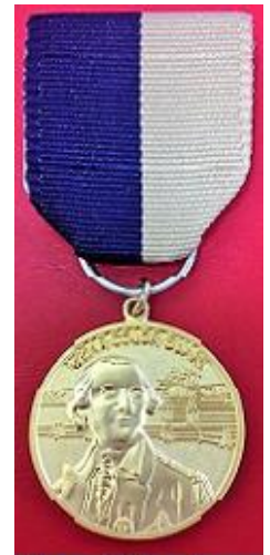
Von Steuben CG Medal

Example 2: The WA SAR Annual Conference is over two days. On one day is the PDM (now the "PDC") Uniformed color guards who participate in both get credit for two events. (If we are asked to post colors for another organization while at the Conference those attending should earn 1 additional "event".)