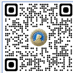
WA State Web Site