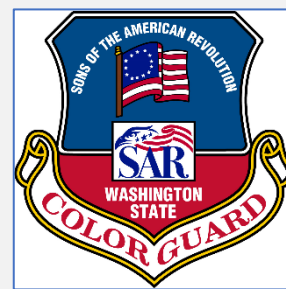
Color Guard Schedule