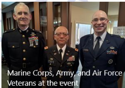
Marine Corps, Army, and Air Force Veterans at the event